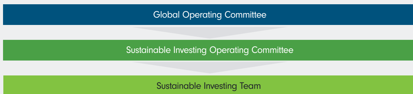
Chart 1: The Sustainable Investing Operating Committee

We seek to exercise all voting rights in accordance with all applicable laws and regulations, as well as being consistent with the respective investment objectives of the various portfolios. Where Fidelity sub-delegates investment management responsibility for certain assets to third parties, this policy will not apply to those assets and,