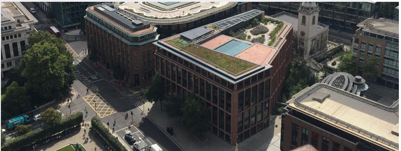
Cannon Street office, Fidelity International.

When contacting us, please note that FIL Limited (Fidelity International), our organisation, and its subsidiaries and affiliates, are independent, distinct and separate companies from Fidelity Investments / Fidelity Management and Research Company (FMR) and Fidelity Institutional Asset Management (FIAM), which together are referred to as Fidelity Asset Management (FAM), as well as other organisations with similar names. Strict information barriers are in place to ensure that sensitive investment and voting data is not shared between the investment professionals of FIL Limited and FAM.