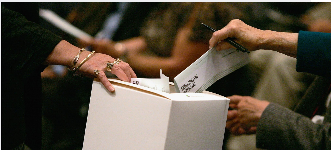
Shareholders place their votes into a ballot box.

We maintain close relationships with a range of shareholders as well as other agents of corporate change. Where legally permitted, we are willing to consider collaborative engagement initiatives which may involve filing shareholder meeting resolutions.