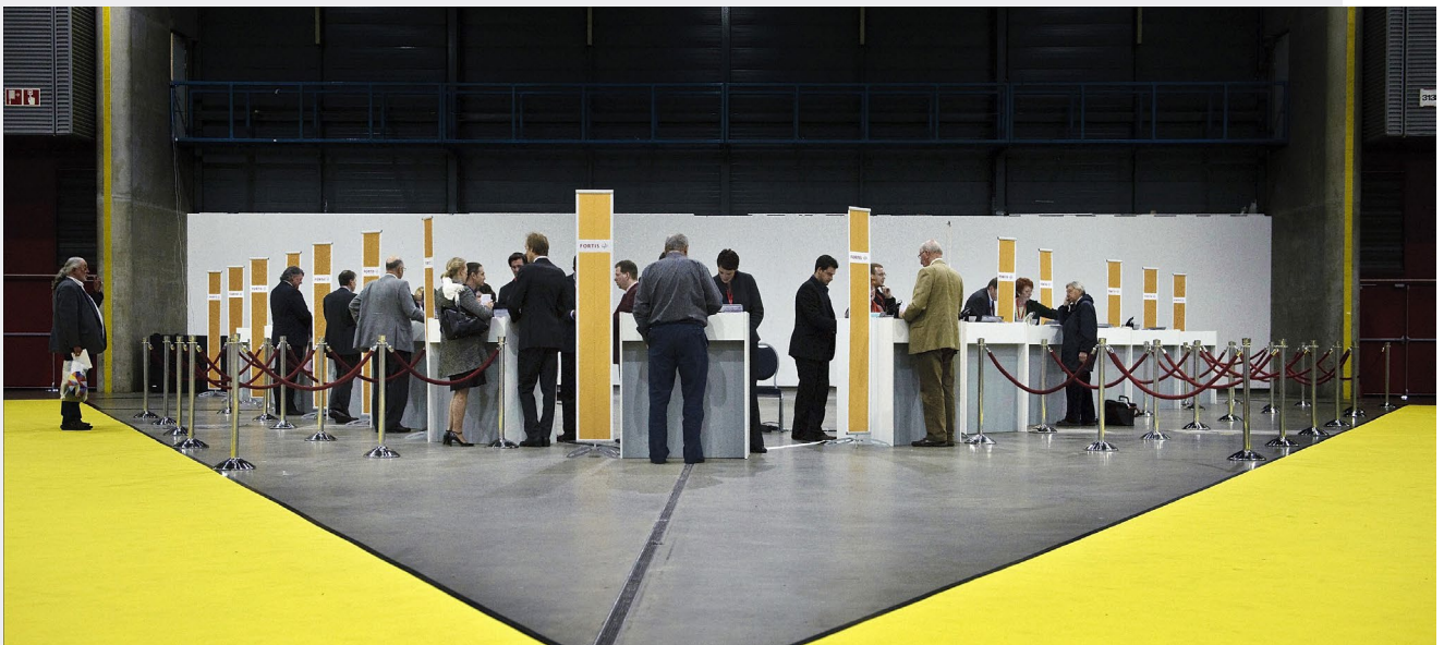
Shareholders cast their vote.

We discuss voting issues with our investee companies, who often seek to engage stakeholders to share agenda and meeting materials, and we also respond to companies' requests for information about our voting