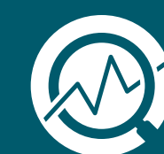
Figure 2. Main categories of strategy

2. Equity beta calculated over a rolling 26-week lookback period.